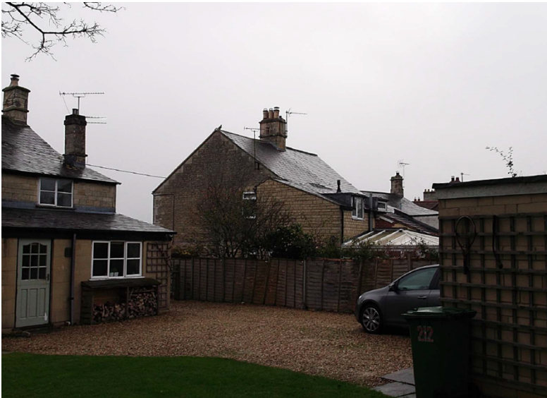
No. 211 to the rear of the photo

Turning to the side elevations, the proposal would create a new window in either side elevation for two bathrooms. Both of these windows are recommended to be conditioned to be obscure glazed. The window to the north-east elevation, facing No. 213, would be directly opposite the one and half storey element to the rear of No. 213 and would not create any overlooking of the neighbouring property or its amenity area. Turning to the elevation facing No. 211, there is existing first floor bedroom window. Also there are existing windows and openings facing towards the application property including at first floor level overlooking into the amenity area of the applicants dwelling.