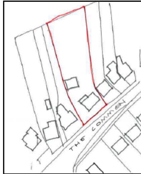
Extract from applicants Site Location Plan

The proposed extension extends off the rear of No. 212 and would enhance the size of the existing bedrooms that face the rear garden at present. Directly behind the host dwelling is an existing large single storey double garage which would provide a degree of screening from any potential overlooking from the rear elevation of No. 212 over any neighbouring properties gardens. No. 209 is displaced from the application site by two dwellings and No. 210 is displaced by one dwelling. As such, the potential for any degree of impact is minimal; equally so with the rear amenity space of 210, it is therefore considered that the concerns raised about loss of privacy to these two properties amenity space, would be inconsequential and it would not substantiate a robust reason for refusal.