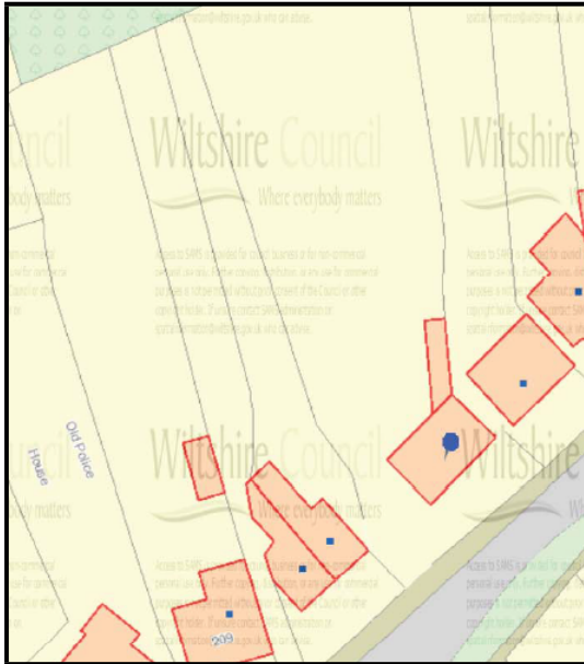
OS Plan down load from SAMS

The two properties located directly either side of the proposed extension are numbers 211 and 213. Property 210 forms a semidetached unit to 211 and lies to the southwest of this dwelling. Property 209 lies again to the southwest of No. 210. As described above, the layout of the gardens along this street mean that the gardens start to run behind that of the neighbouring properties, for example the garden of No. 209 runs behind 210, the garden to 210 runs behind 211 and so on (reference site location plans below).